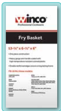
Packaging lists the models each FB item fits