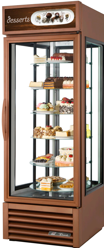
Shown with optional Dessert Sign.