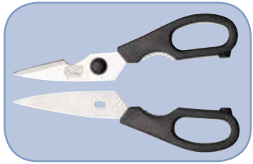
KS-06 is detachable