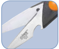
Built-in bottle cap opener