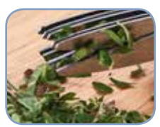
Cut, chop, mince herbs