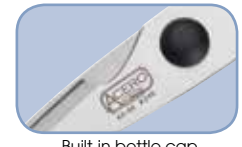
Built-in bottle cap opener