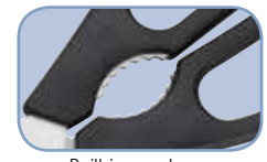
Built-in cracker or bottle cap grip