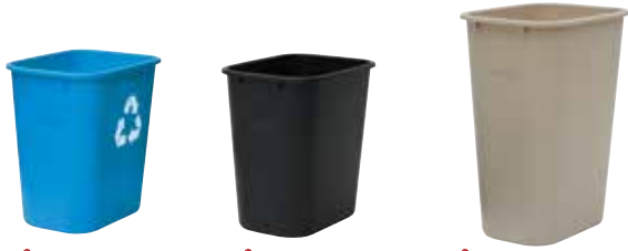
NEW PWR-28L NEW PWR-28K NEW PWR-41BE