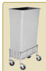
Fits most standard slim trash cans