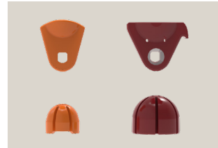
Juice extraction kit

Medium(M): Orange; Optional- Large (L): Maroon.