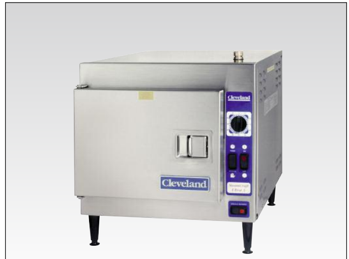
Shown with optional Electronic Timer