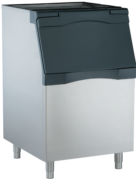
B530S shown with optional KLP8S legs