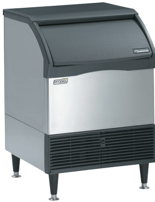
CU1526 / CU2026