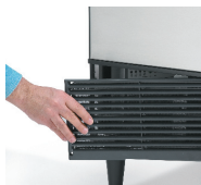
Front Air Filter