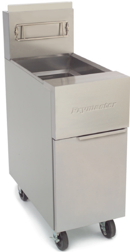
GF40 Shown with optional casters