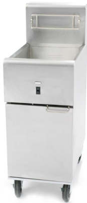
SR14E Shown with optional casters.