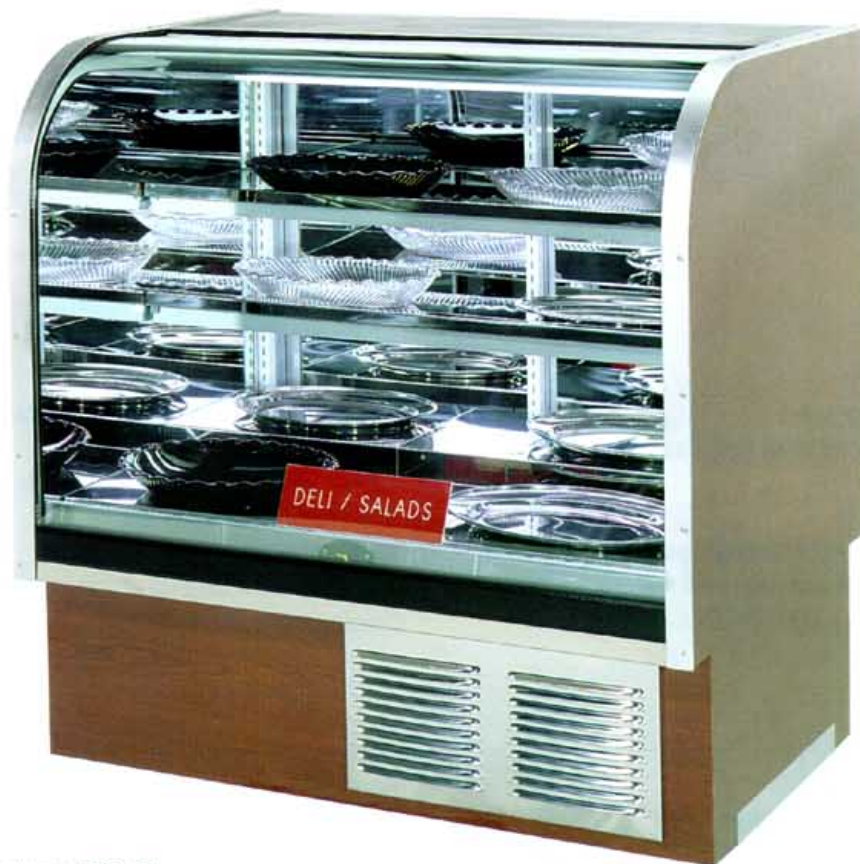
model shown DCR-48